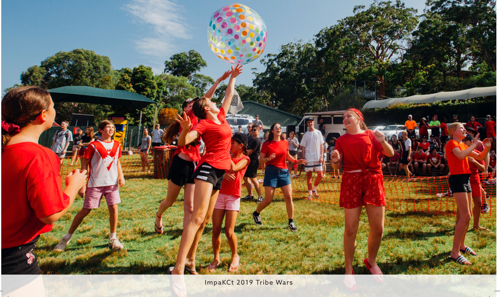
ImpaKCt 2019 Tribe Wars